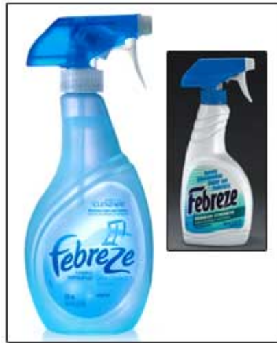
Product Ventures has helped shape the Febreze identity from the start as a pioneering product with a soft side. The new bottle — even softer and more attractive — separates Febreze from the pack and encourages more frequent use.

Clarke explains the final effect: "The redesign clearly speaks to product function and differentiates on shelf. Because of its upscale, elegant design, Febreze is less likely to be relegated to 'out of sight' storage areas. Top of mind reinforces the brand and on-hand